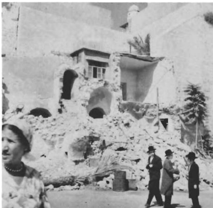
Arab houses destroyed by the Israelis in 1967 to give more Jewish access to the "Wailing Wall".

Moreover, the Chief Rabbi of the Israeli army, Brigadier Goren, conducted a prayer, together with some followers, in the Haram Al-Sharif (Holy Mosque), thus blatantly offending Muslim susceptibilities and infringing upon their established rights, while the Minister for Religions in Israel announced that the Muslim Mosque is Jewish property, and that sooner or later they will rebuild their temple there. Finally, the Ministry of Religious Affairs announced its intention of expanding the Wailing Wall area by destroying some of the Muslim buildings surrounding it, and constructing a synagogue there, in contravention of the status quo, and in an outright violation of the rights of Muslims and Muslim Waqf.