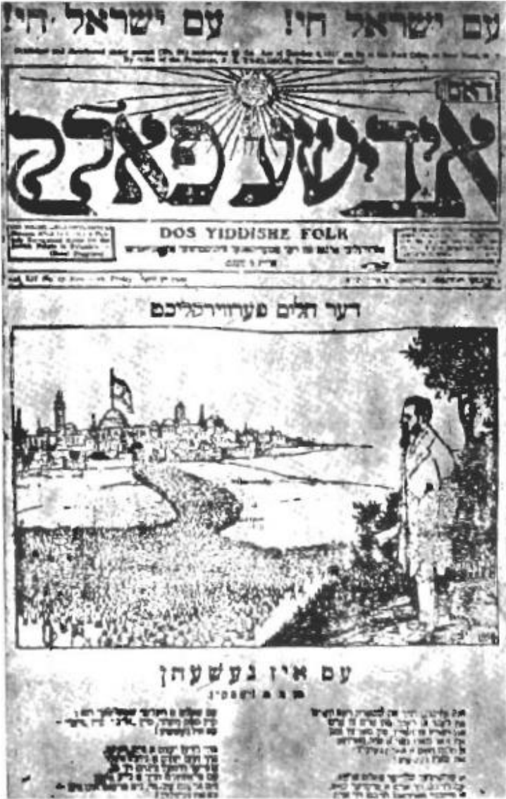
Dr. Theodor Herzl calling upon Jewish masses to take over Dome of Rock to build Jewish temple. The Zionist Flag is placed above the Muslim Holy Mosque.