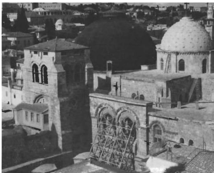
The Church of the Holy Sepulchre, Jerusalem, the central shrine of Christianity. It was built by Emperor Constantine in 330 A.D.

utter disregard shown by the occupation forces toward the Holy Places and the religious sensibilities of the people in Jordan and in the rest of the world. The desecration of the Christian churches, especially the Church of the Nativity and the Church of the Holy Sepulchre, of which we know personally, includes smoking in the churches, littering the churches, taking dogs inside and entering in inappropriate manner of dress. Behavior such as this cannot be construed other than as a direct insult to the whole Christian world. 16